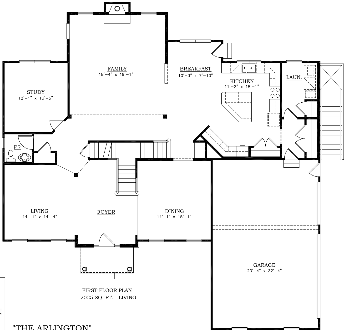
FIRST FLOOR PLAN 2025 SQ. FT. - LIVING